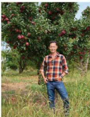
Savoring summer among the trees at The Orchard at Apple Lane in Auburn, California.