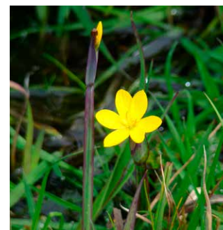
Golden Eyed Grass

very large plant can be more than 6 feet tall with huge leaves divided into maple-shaped leaflets. A flat cluster of flowers sometimes measuring a foot in diameter sits atop the stout hollow stalk.