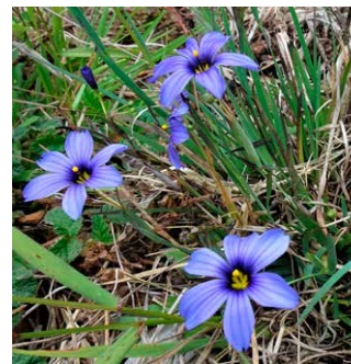
Blue Eyed Grass