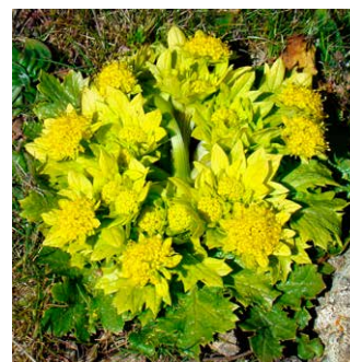
Footsteps of Spring