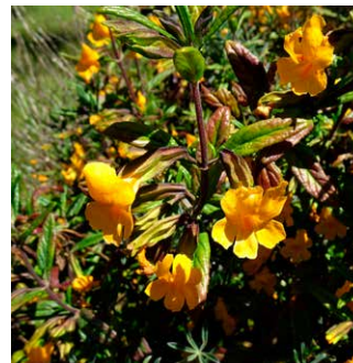
Bush Monkey Flower